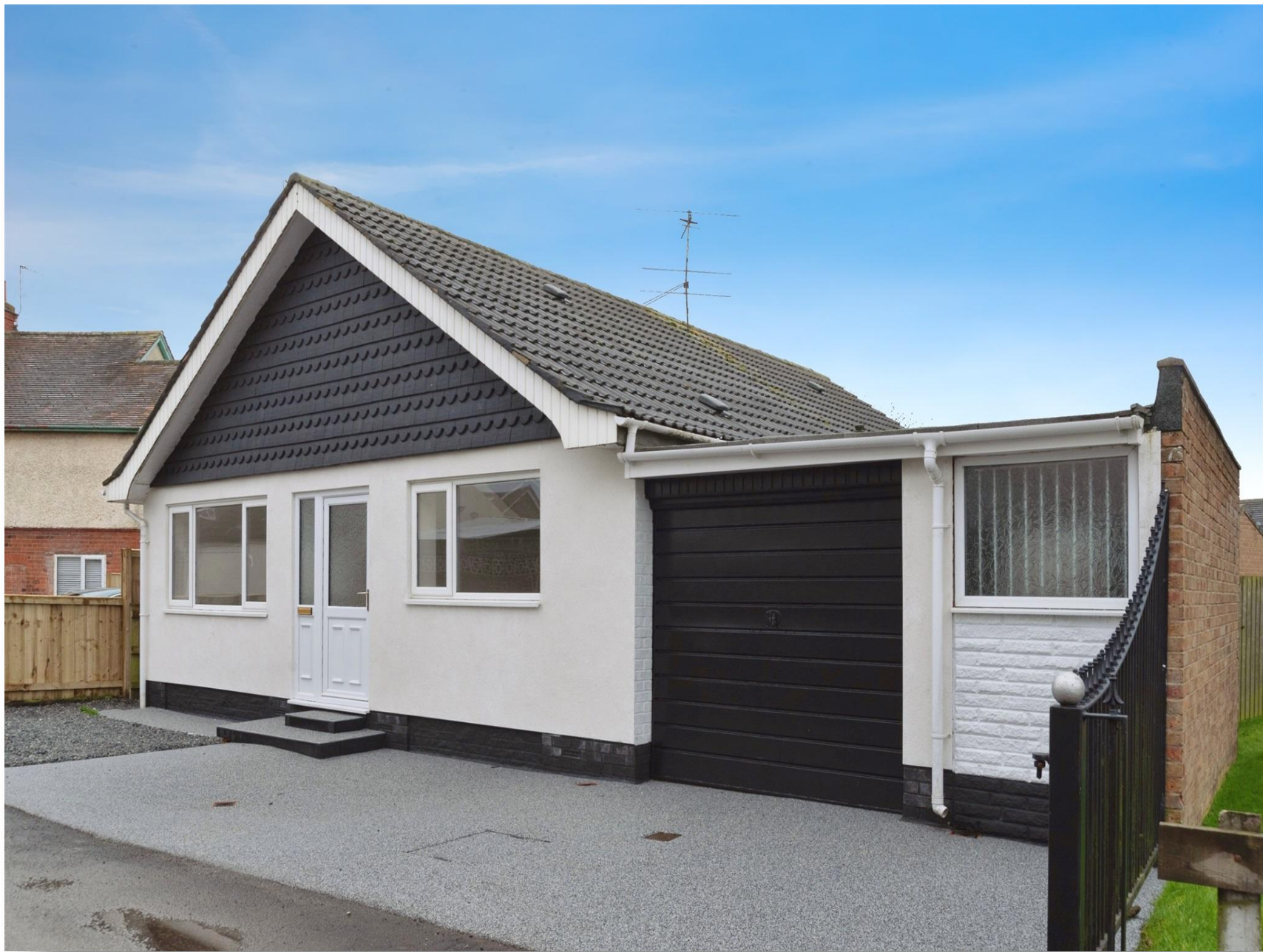
Leads Bungalows, Sutton-On-Hull, Hull HU7 4XW