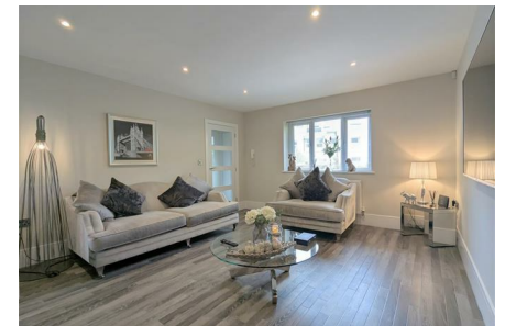
GOLF | CHARLOTTE HOUSE, GROUND FLOOR, 35-37 HOGHTON STREET, SOUTHPORT, MERSEYSIDE, PR9 0NS