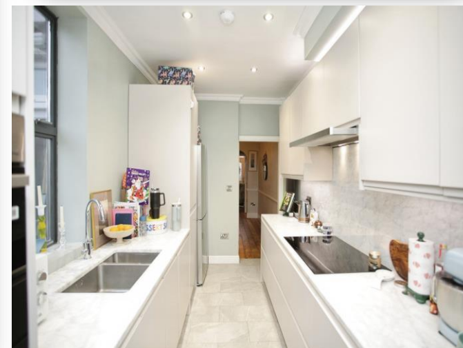
Hollycroft, Hinckley LE10 0HE