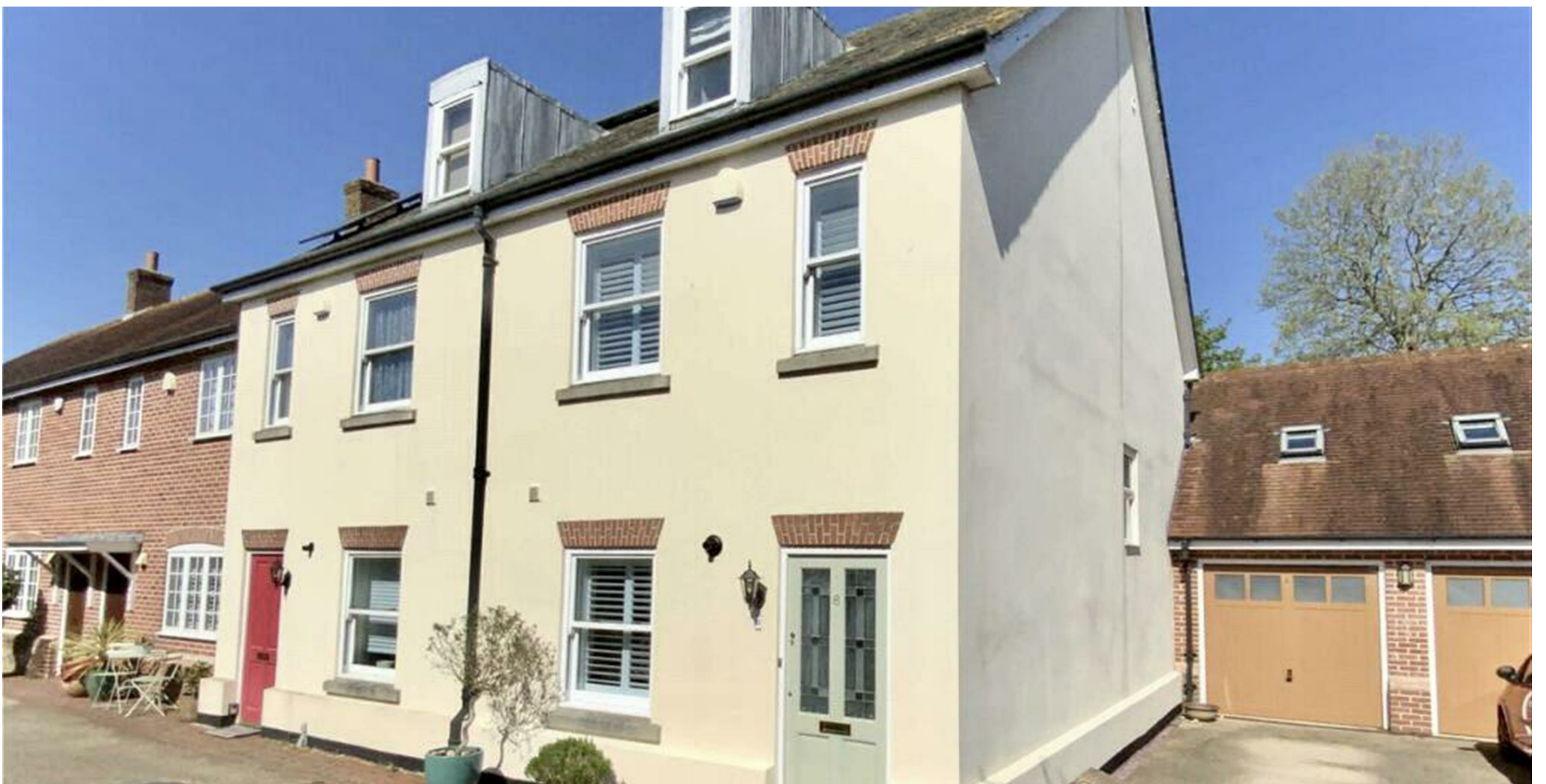
6 Tamlyn's Farm Mews, Purewell, BH23 1FD