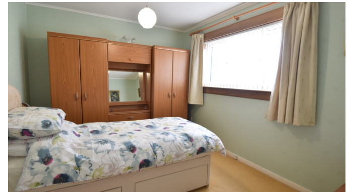
4 Beaulay Drive