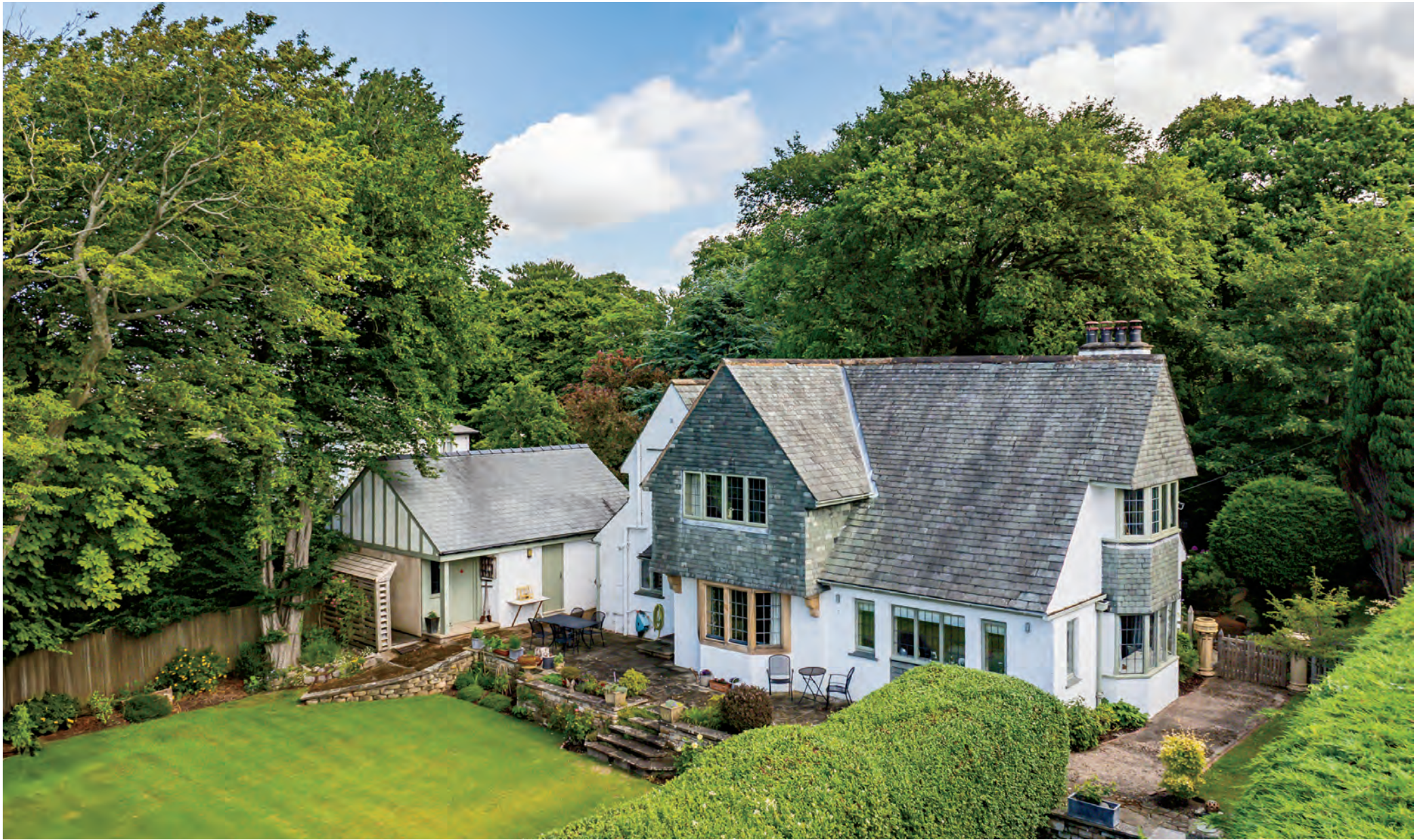
Bracondale 10 Hest Bank Lane | Hest Bank | Lancaster | Lancashire | LA2 6DG