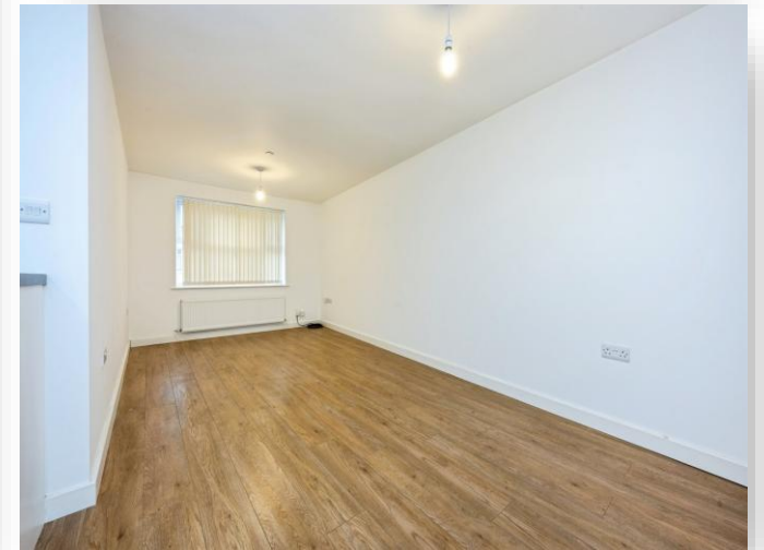
White Lion Mews, North Street, Leighton Buzzard, LU7 1EL