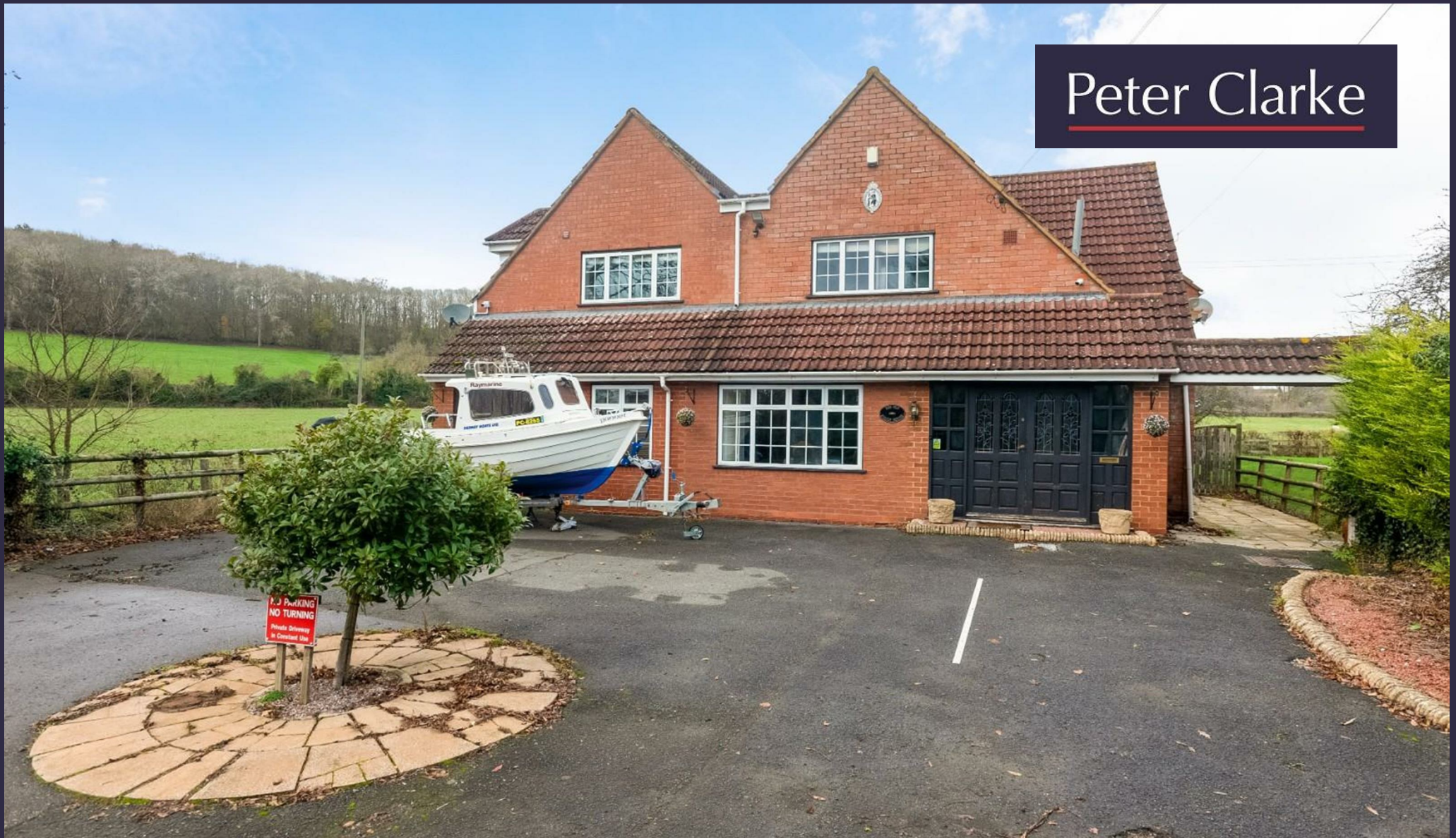
The Old Police House, Binton, Stratford-upon-Avon, CV37 9TE