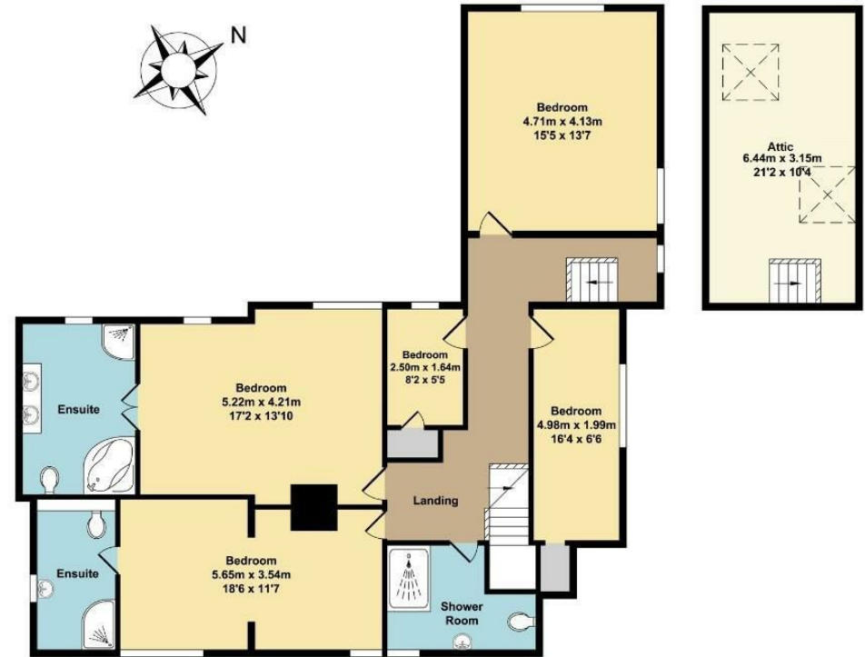
First Floor Approx. Floor Area 114.05 Sq.M. (1228 Sq.Ft.)