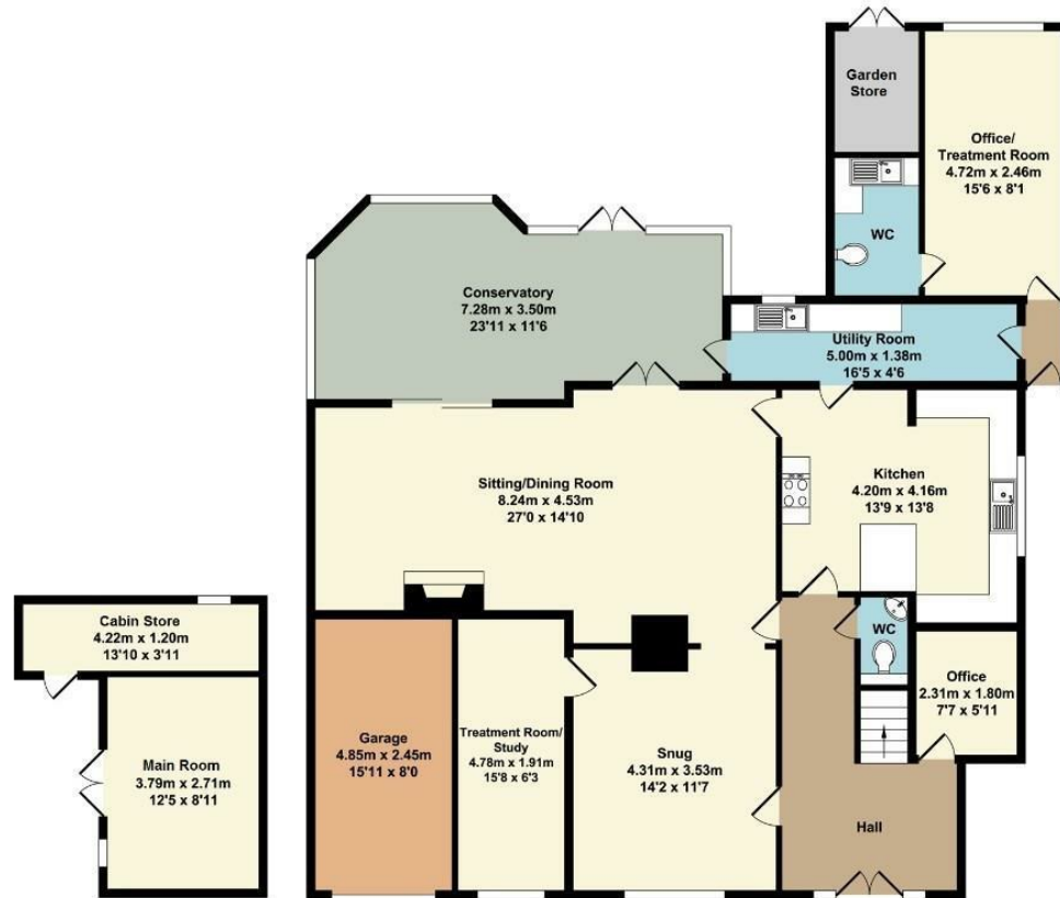
Log Cabin Approx. Floor Area 15.60 Sq.M. (168 Sq.Ft.)

Whilst every attempt has been made to ensure the accuracy of the floor plan contained here, measurements of doors, windows, rooms and any other items are approximate and no responsibility is taken for any error, omission, or mis-statement. This plan is for illustrative purposes only and should be used as such by any prospective purchaser. The services systems and appliance shown have not been tested and no guarantee as to their operability or efficiency can be given.