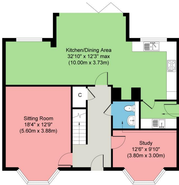
Ground Floor Approximate Floor Area 917 sq. ft (85.19 sq. m)