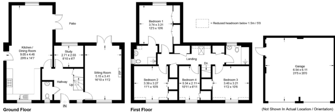
Illustration for identification purposes only, measurements are approximate, not to scale. Fourlabs.co © (ID1307673)

Approximate Gross Internal Area = 146.6 sq m / 1578 sq ft Garage = 39.9 sq m / 429 sq ft Total = 186.5 sq m / 2007 sq ft