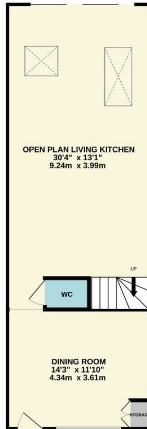
GROUND FLOOR 599 sq.ft. (55.6 sq.m.) approx.