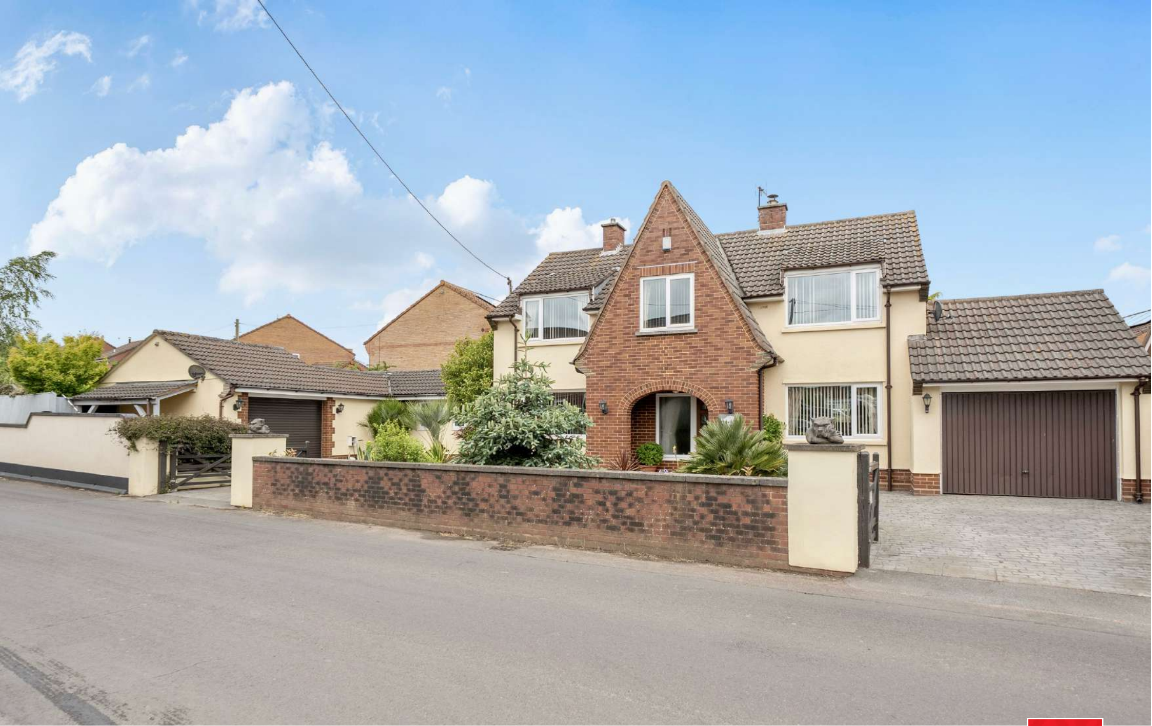
Mover Lea House Newton Road, North Petherton TA6 6NA