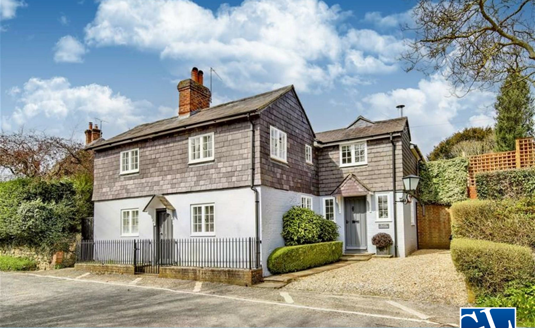
Slate Cottage, The Street, Bury, West Sussex RH20 1PF