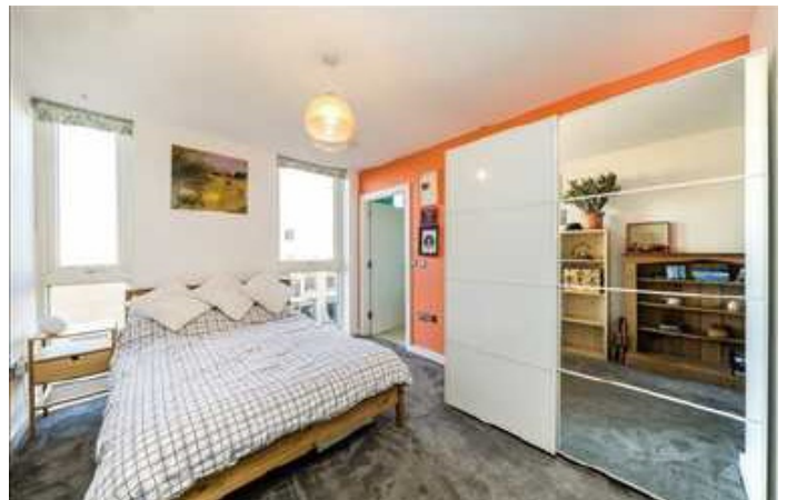
Batavia Road, SE14