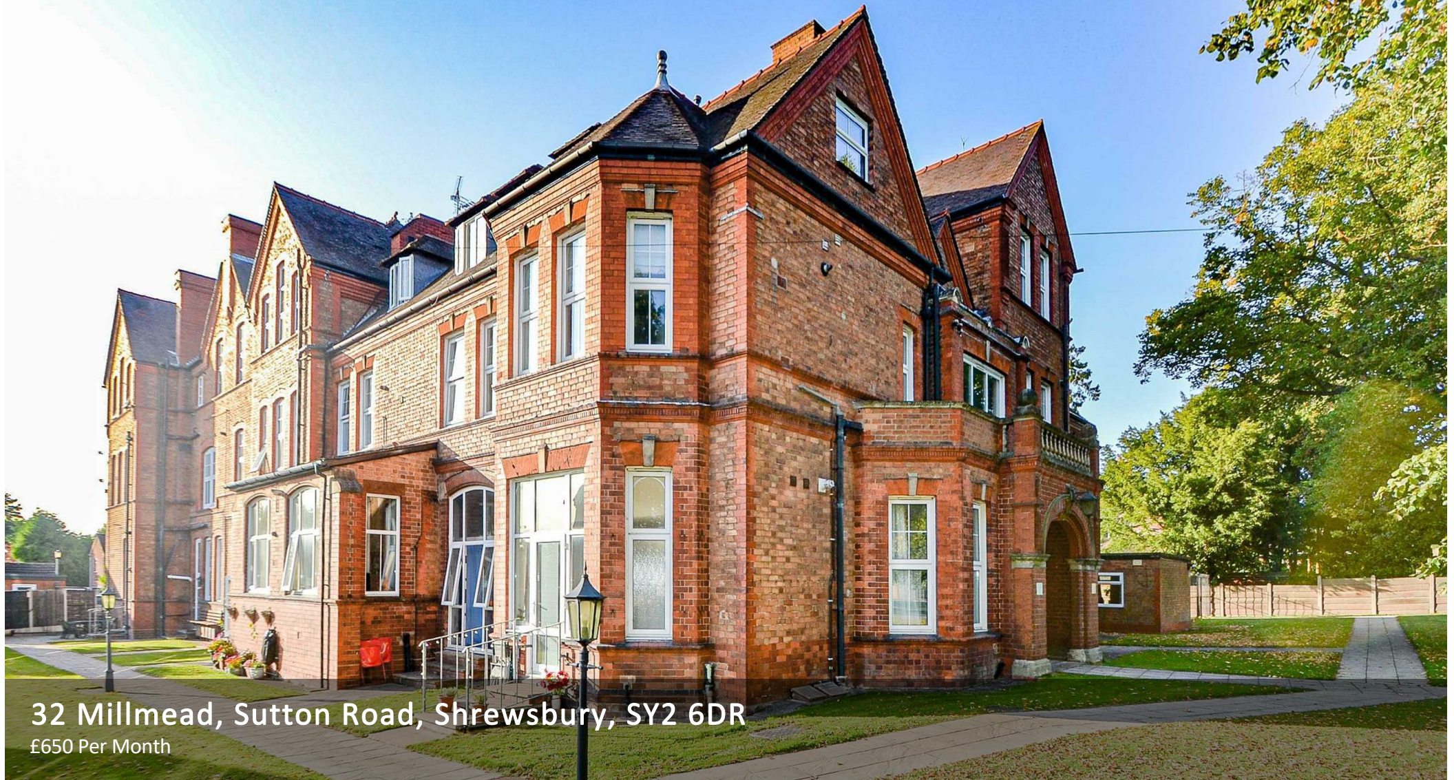
32 Millmead, Sutton Road, Shrewsbury, SY2 6DR £650 Per Month