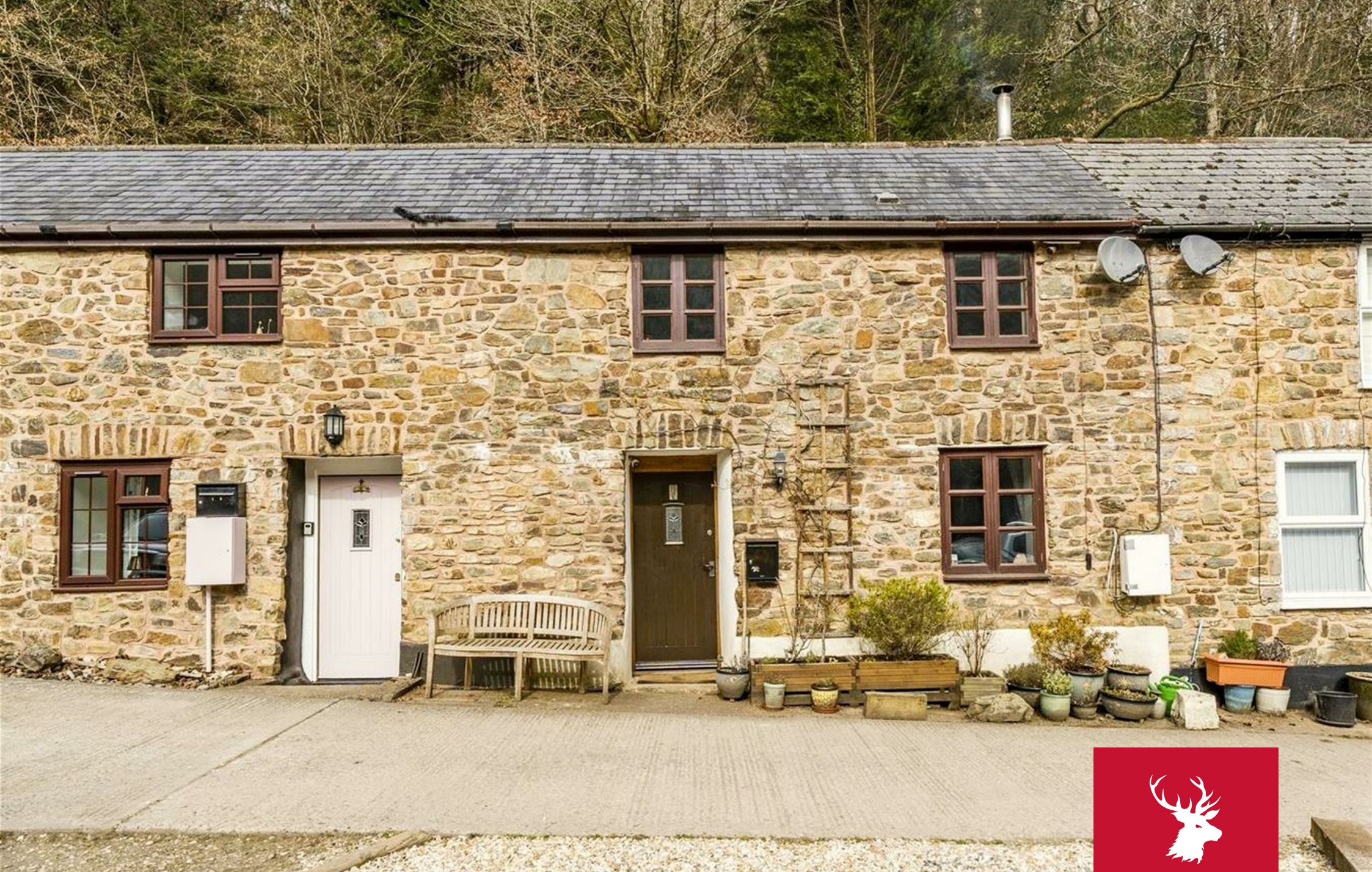
1 Townwood House