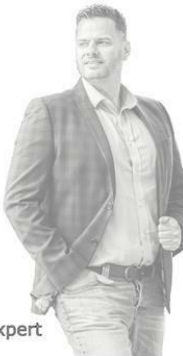
The Leamington Property Expert