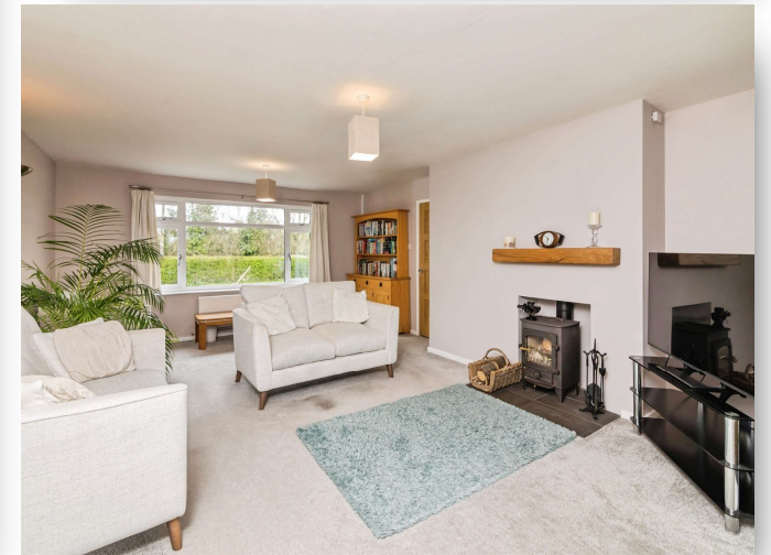
Broad Oaks Common Road, Aldeby Beccles NR34 0BL