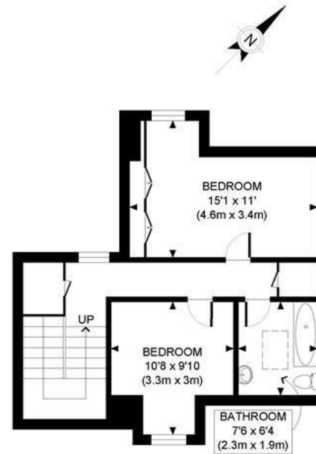
THIRD FLOOR GROSS INTERNAL FLOOR AREA 423 SQ FT

APPROX. GROSS INTERNAL FLOOR AREA: 981 SQ FT/ 91 SQM