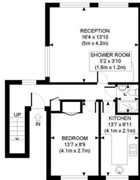
SECOND FLOOR GROSS INTERNAL FLOOR AREA 558 SQ FT