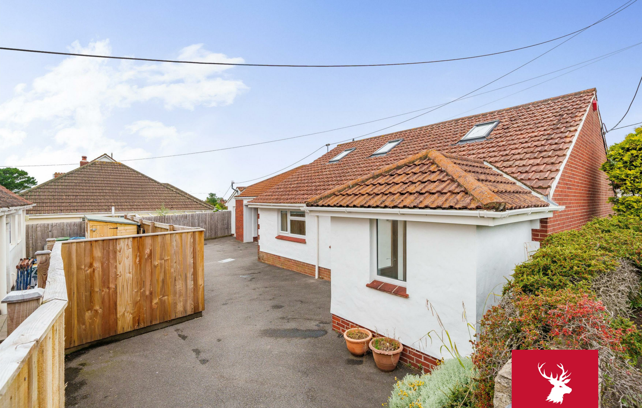
The Lodge & The Old Workshop