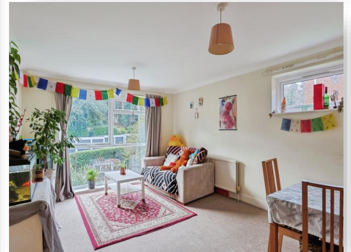
Bramley Court Surrey Road, Poole BH12 1EQ