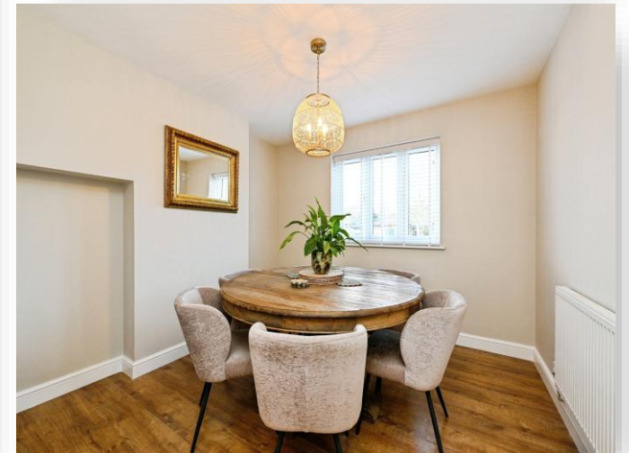
Arundel Drive, King's Lynn, PE30 3BU