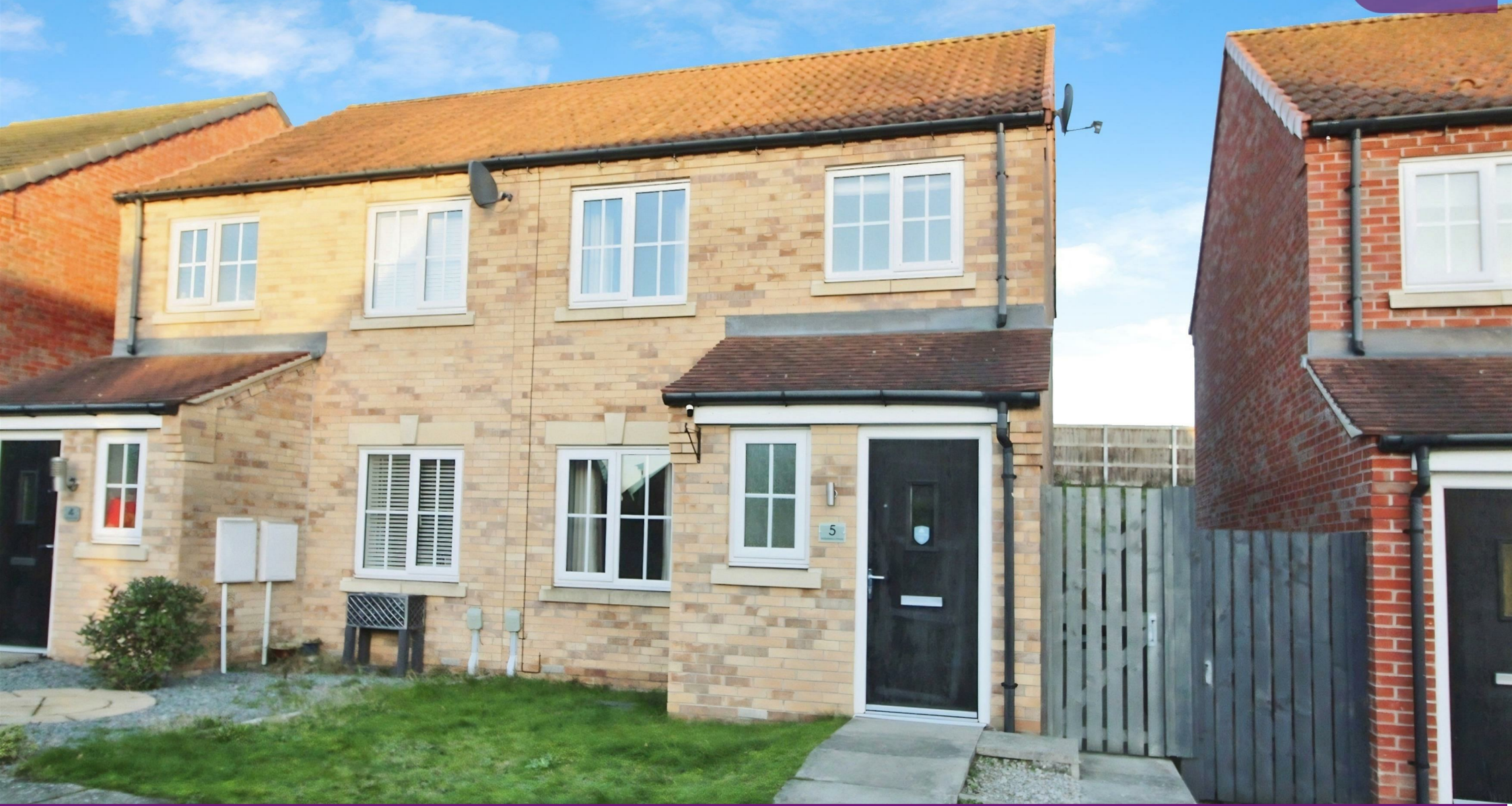
5 Haddon Close, Elloughton, Brough, HU15 1UJ £185,000