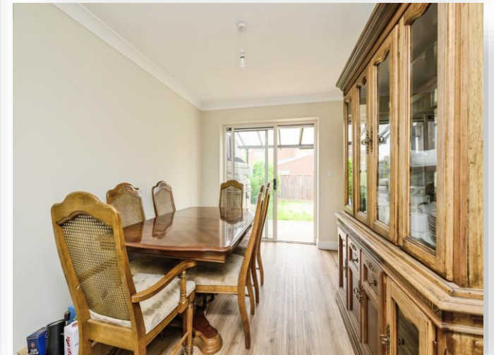
Bentley Avenue, Yaxley Peterborough PE7 3ZT