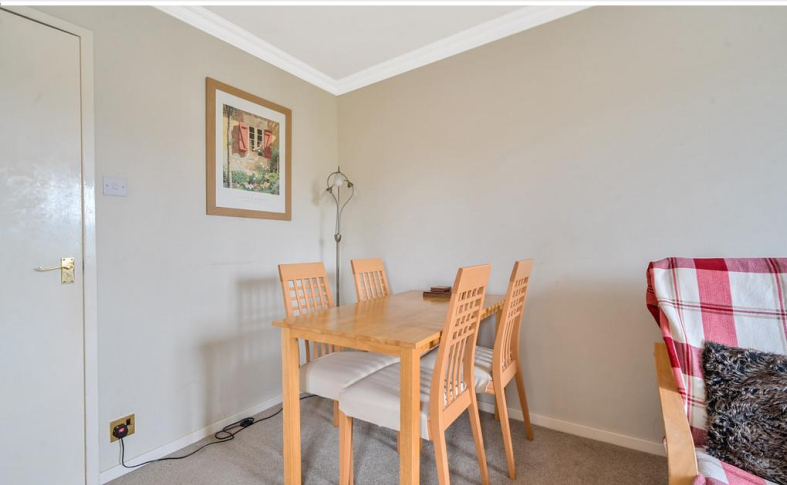
Open Plan Dining Area