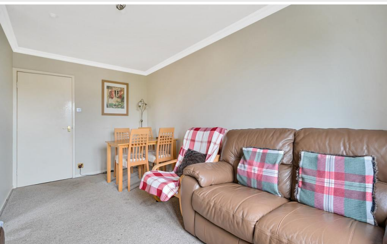
Open Plan Living Room