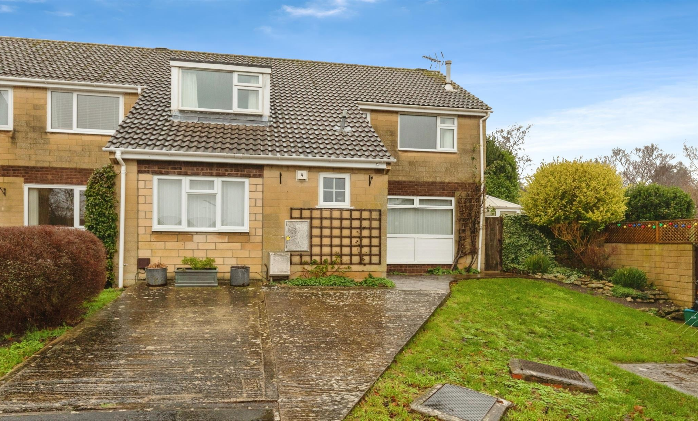
The Linleys, Bath BA1 2XE