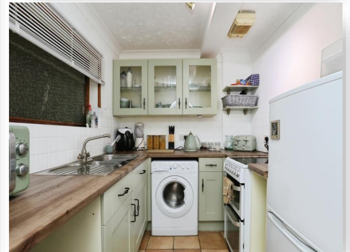
The Maltings, Dereham, NR19 2UH