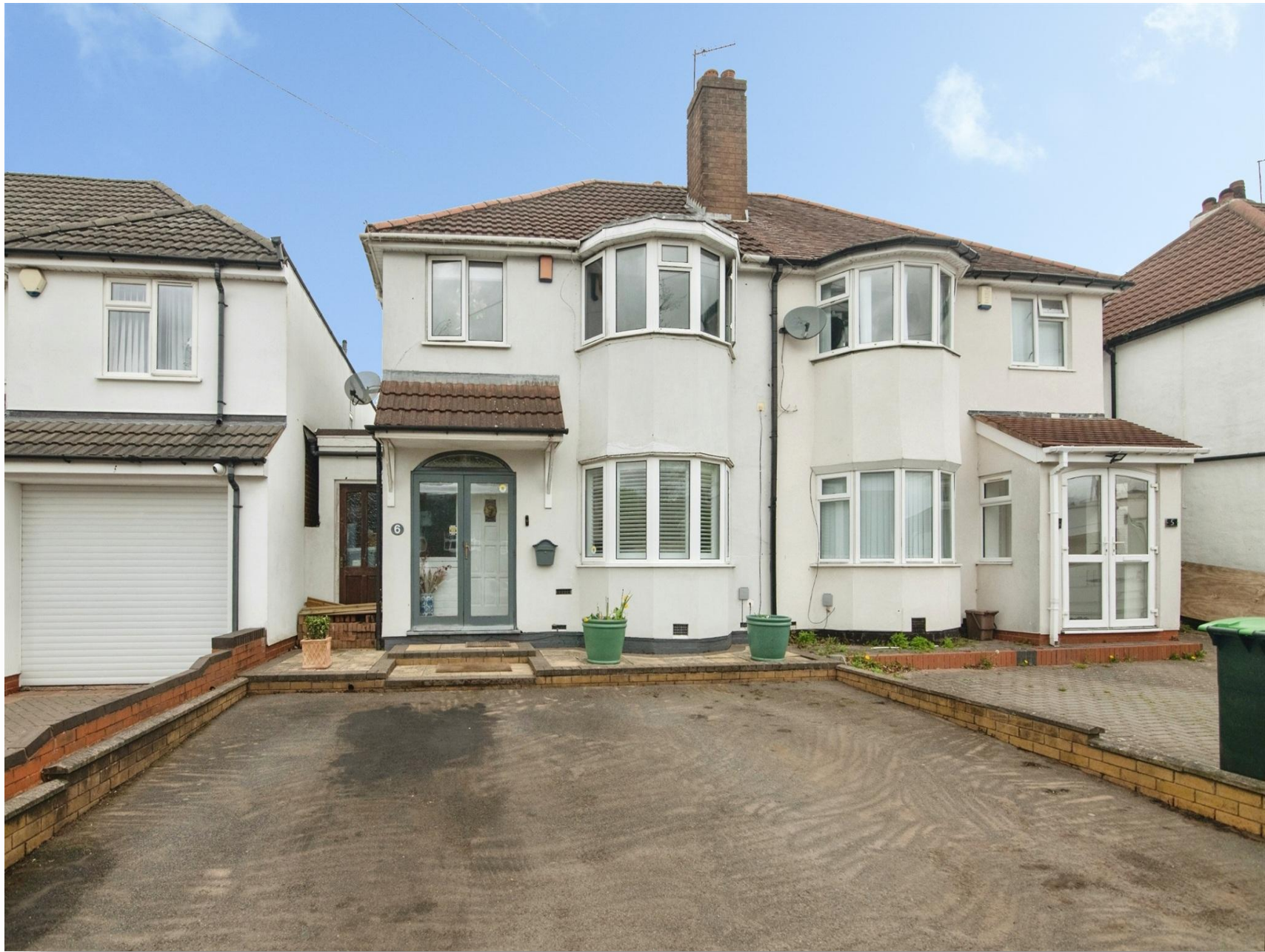
Broome Avenue, Birmingham B43 5AL