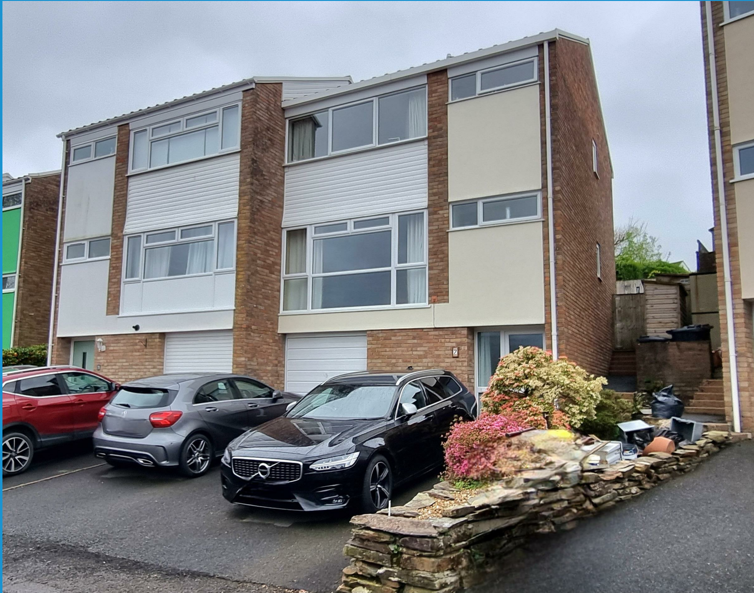
7 Castle Meadows Launceston | Cornwall