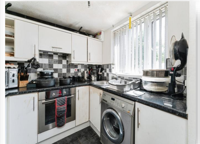
Cavalry Park, March PE15 9DL