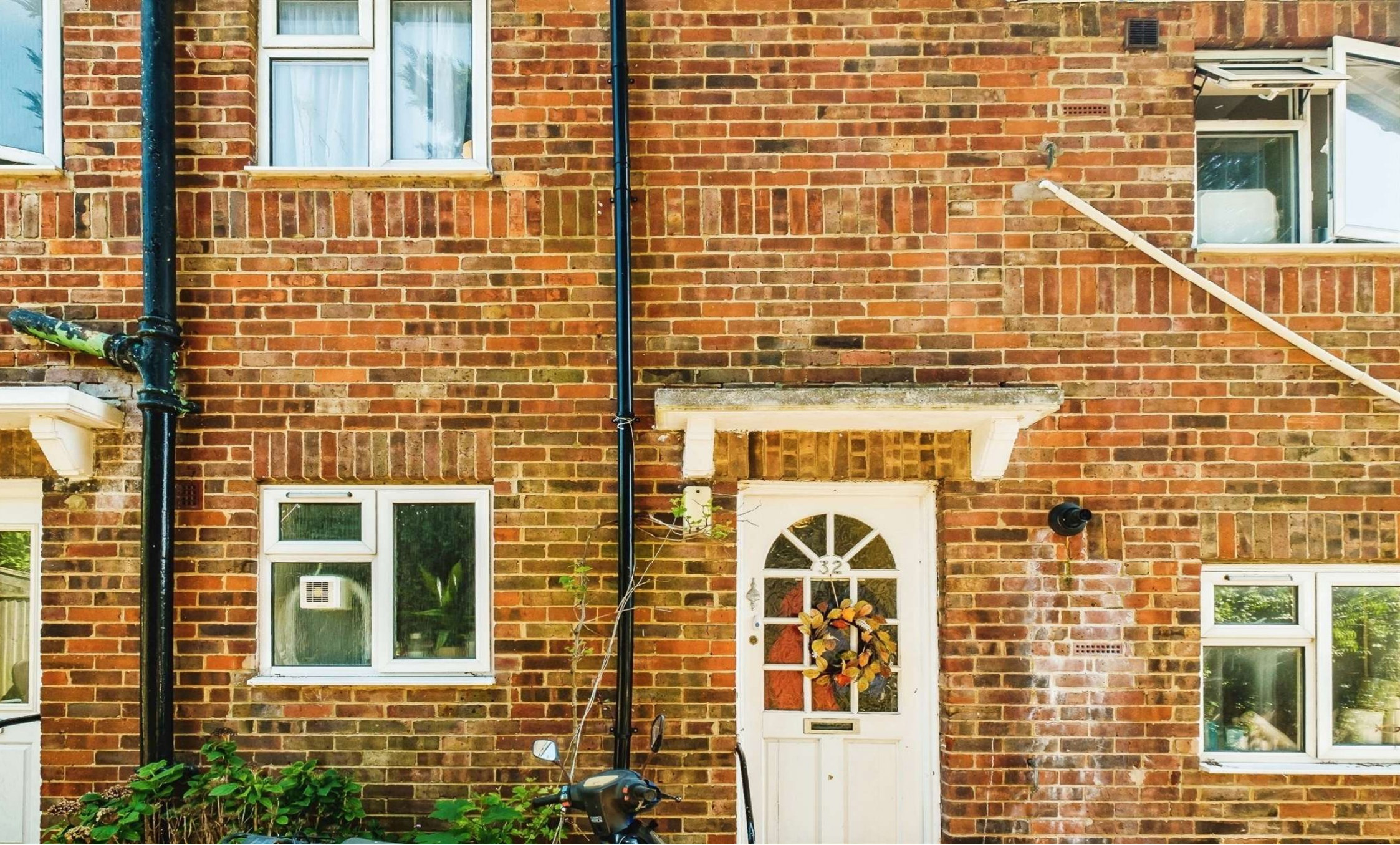
Storrington Close, Hove BN3 8JE