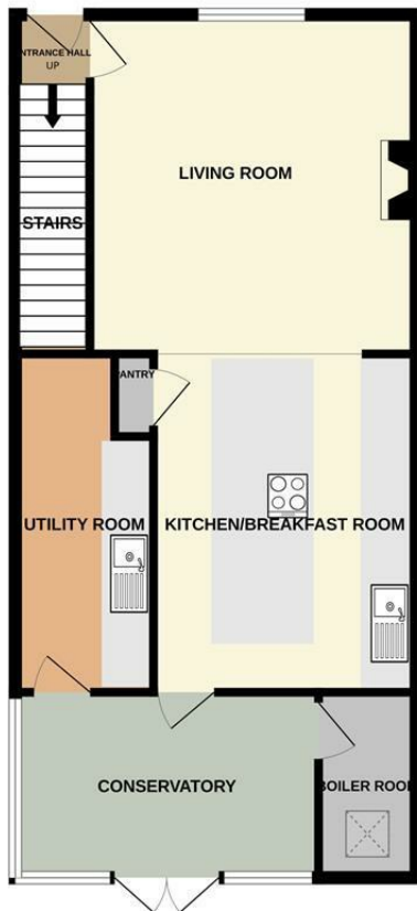
GROUND FLOOR 677 sq.ft. (62.9 sq.m.) approx.