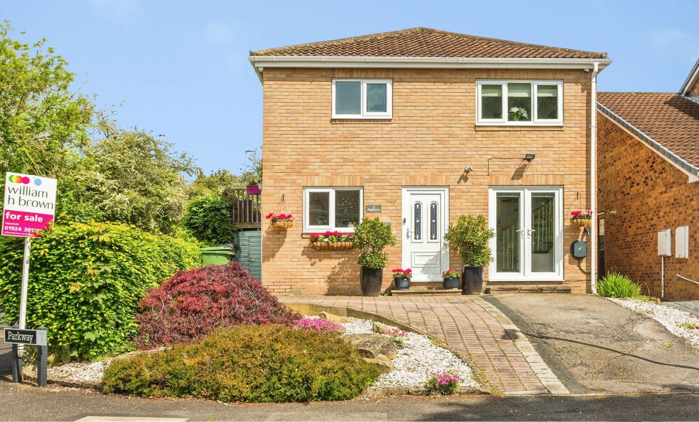
Parkway, Crofton Wakefield WF4 1SX