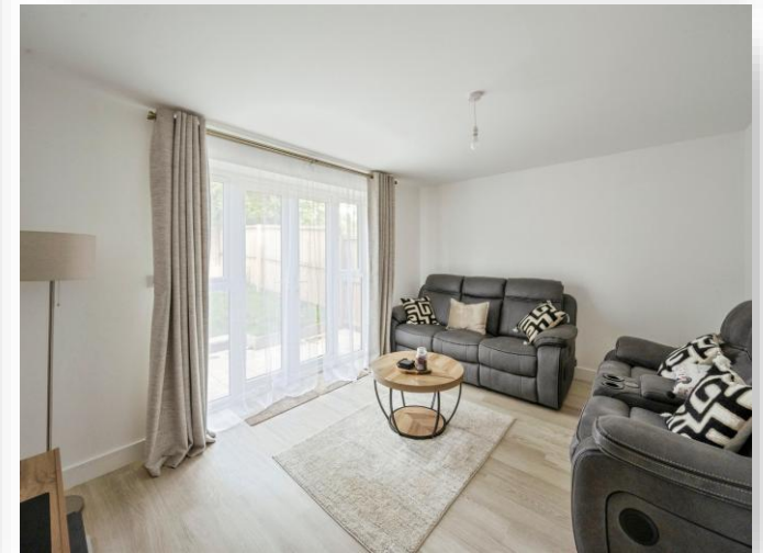
Lime Tree Grove, Wath-upon-Deerne ROTHERHAM S63 7GS