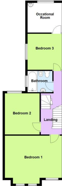
First Floor Approx. 68.8 sq. metres (740.6 sq. feet)