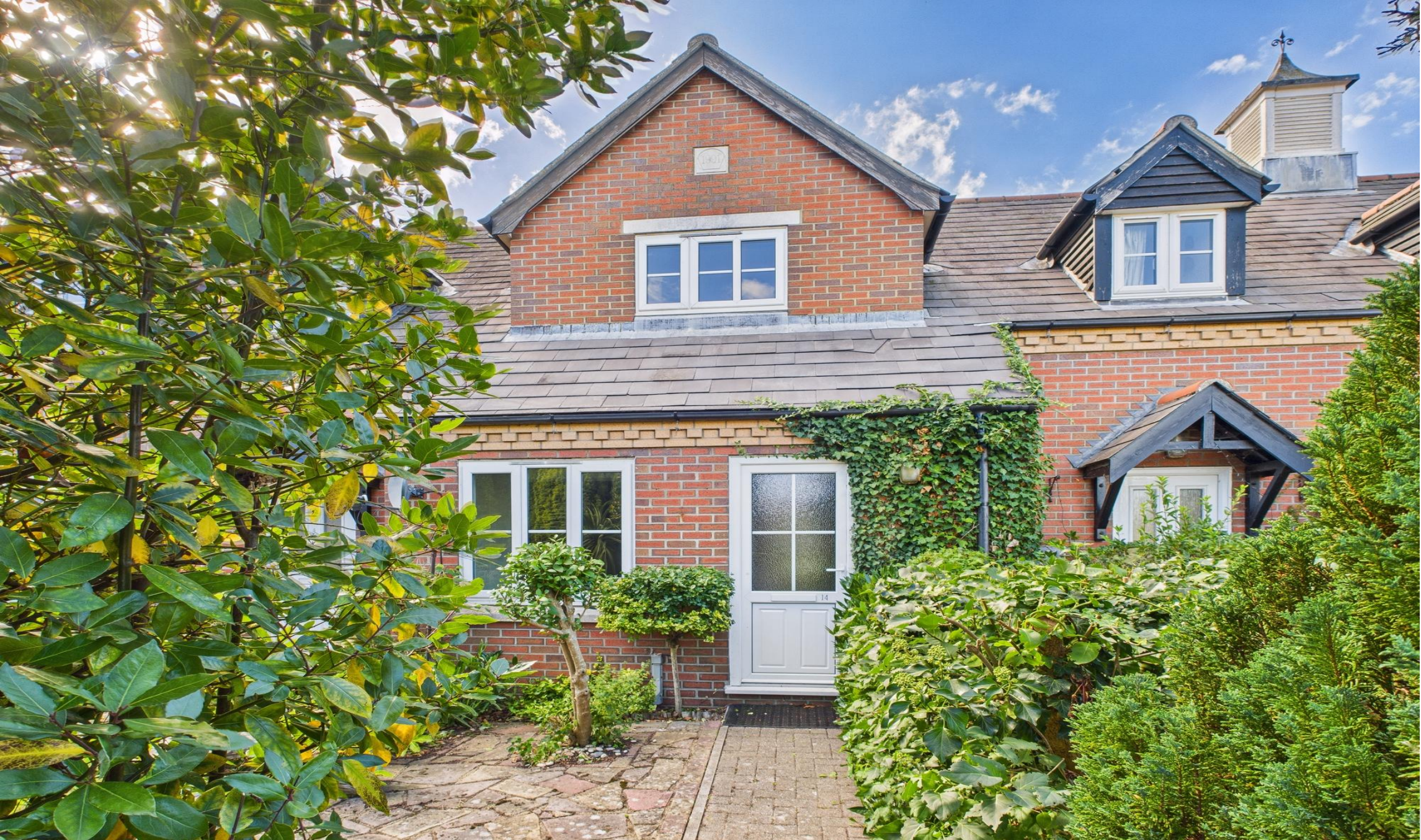
Chapel Close, Fressingfield, Suffolk