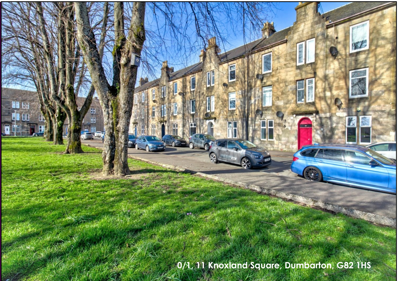
0/1, 11 Knoxland Square, Dumbarton, G82 1HS

David Muir Estate Agents are delighted to offer this beautifully presented two-bedroom ground-floor flat, set within a highly sought-after Dumbarton East location. The property enjoys attractive, tree-lined views across Knoxland Square and sits within a traditional blonde sandstone terrace.