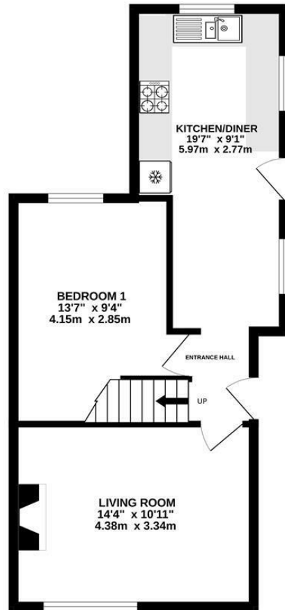
GROUND FLOOR 461 sq.ft. (42.9 sq.m.) approx.