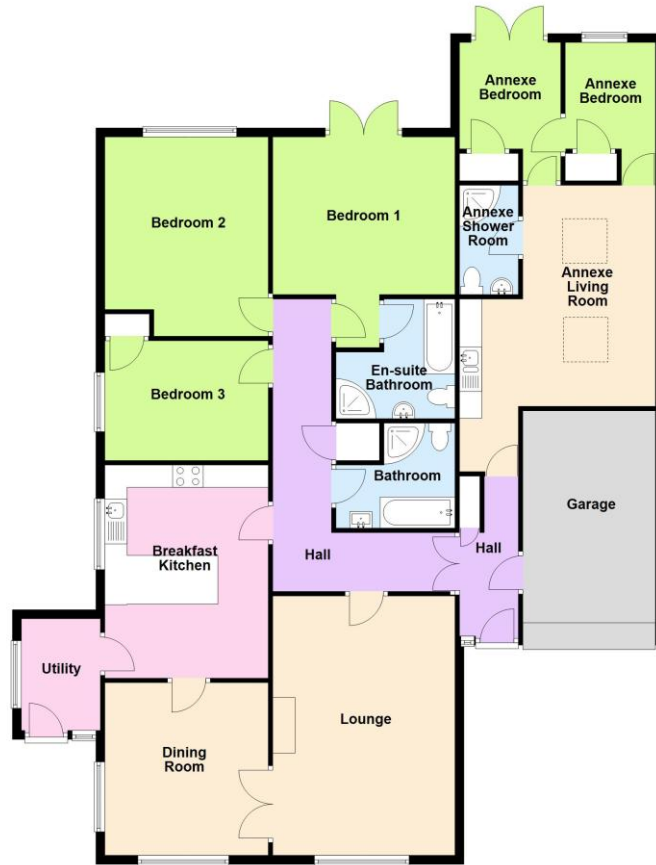
Total area: approx. 191.3 sq. metres (2058.8 sq. feet)