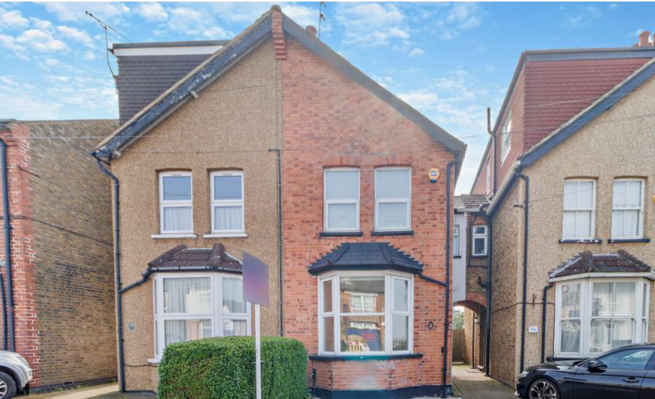
A 2/3 bedroom family home located in the heart of Old Northwood High Street, Northwood, Middlesex HA6 1BJ