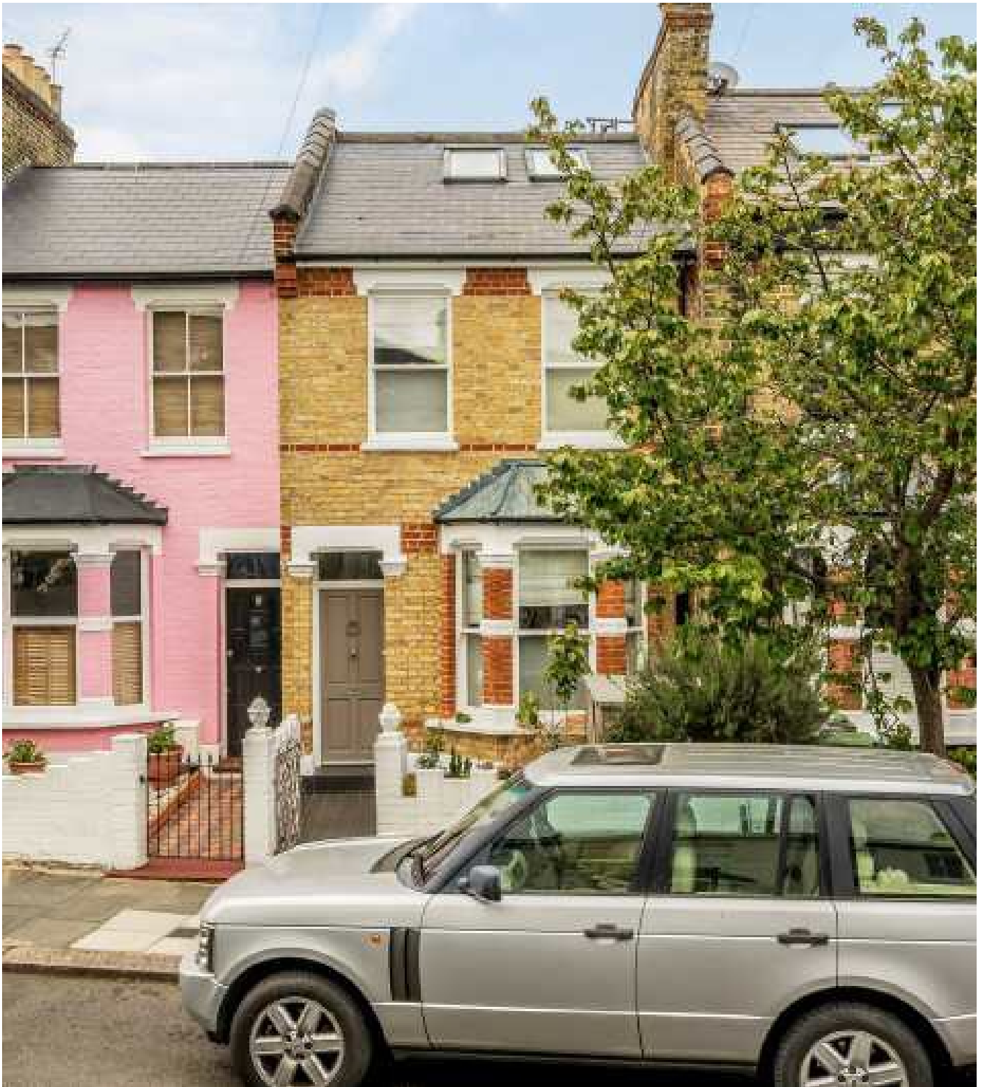
Brecon Road, W6 £995,000