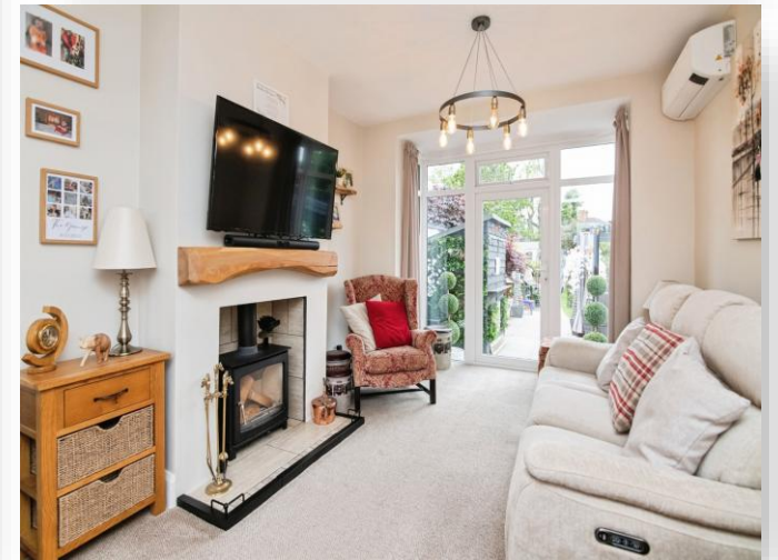
Kingsdown Road, Birmingham B31 1AJ