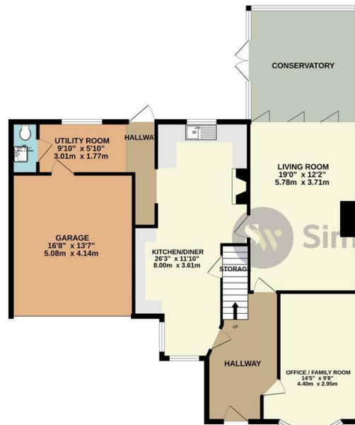
GROUND FLOOR 1204 sq.ft. (111.8 sq.m.) approx.