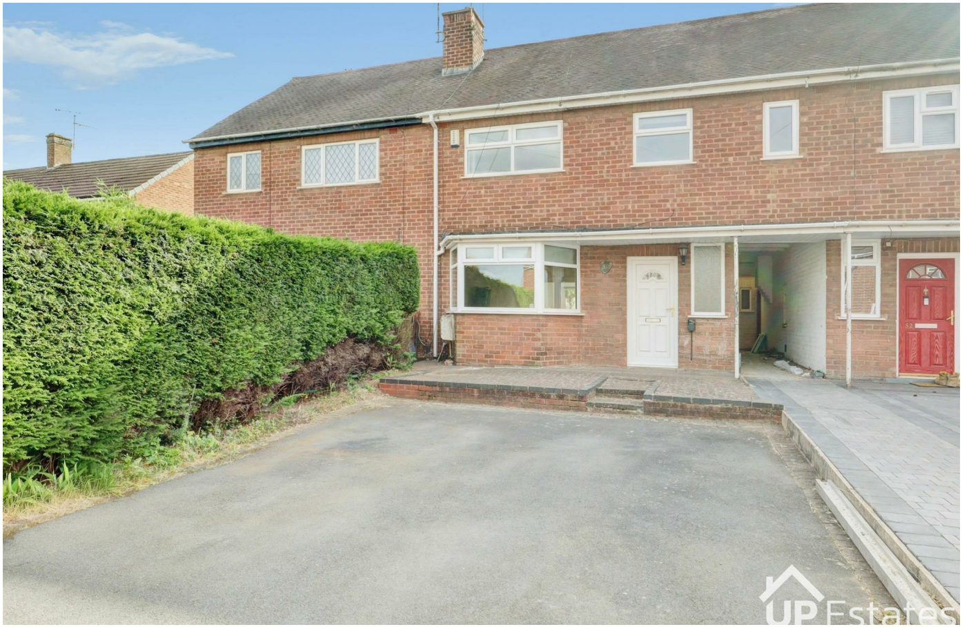
Red Deeps, Nuneaton