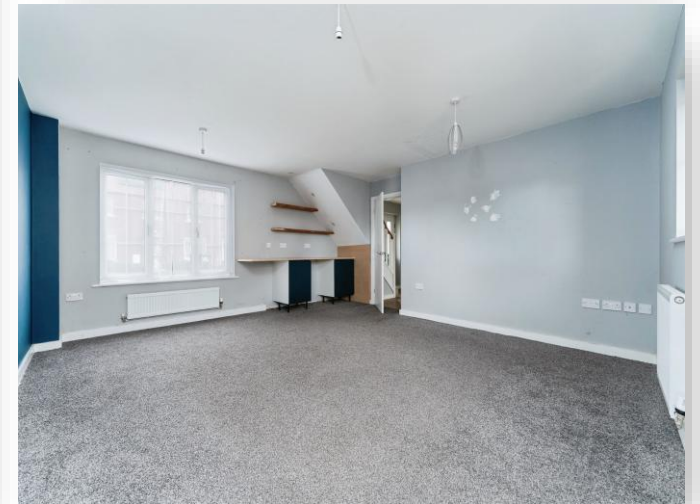
Yeomans Way, Littleport Ely CB6 1FL