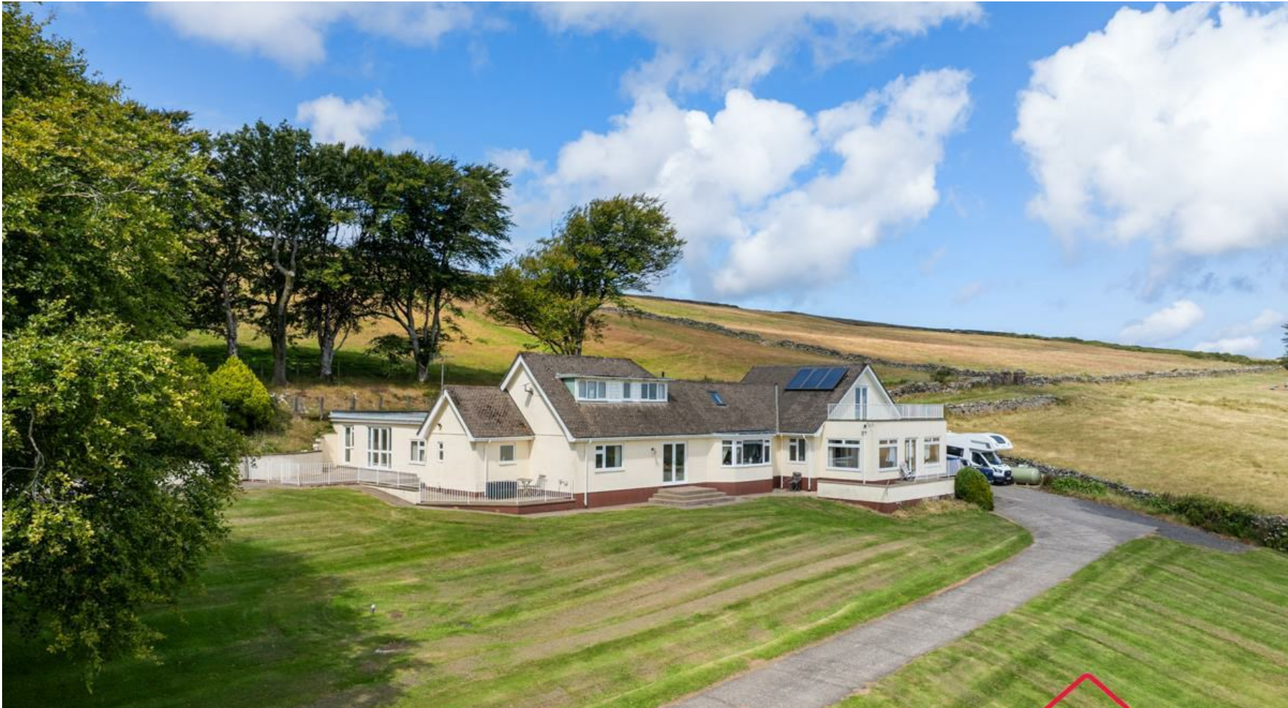
Rhennie Farm Main Road, The Dhoon, Isle Of Man, IM7 1HL Asking Price £1,699,950