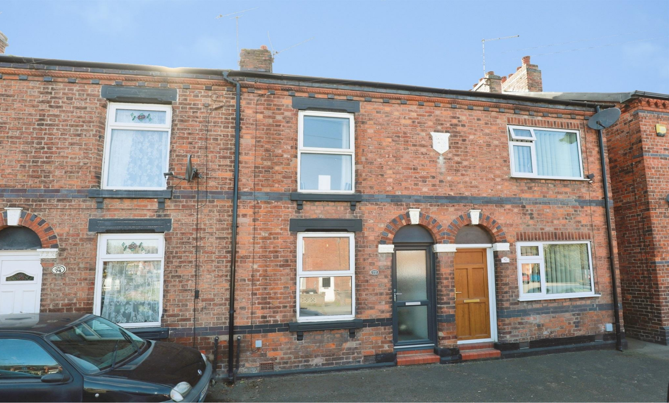
Lewin Street, Middlewich CW10 9AS