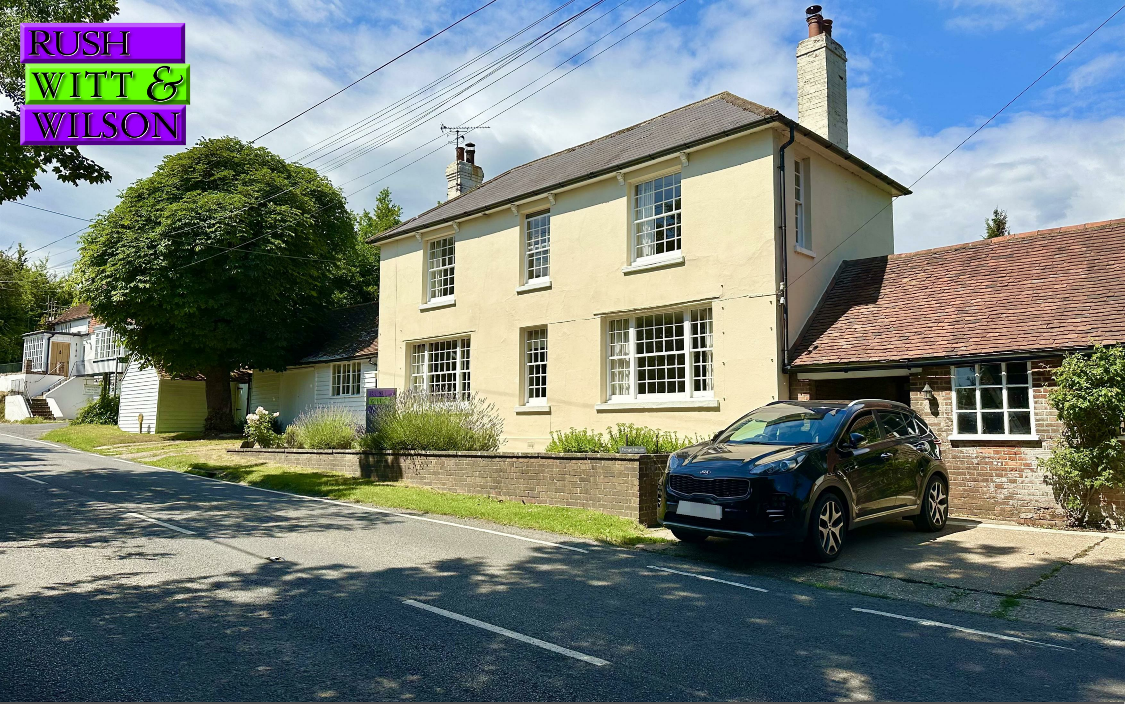
Forge House Udimore Road, Udimore,, East Sussex TN31 6AY Guide Price £750,000