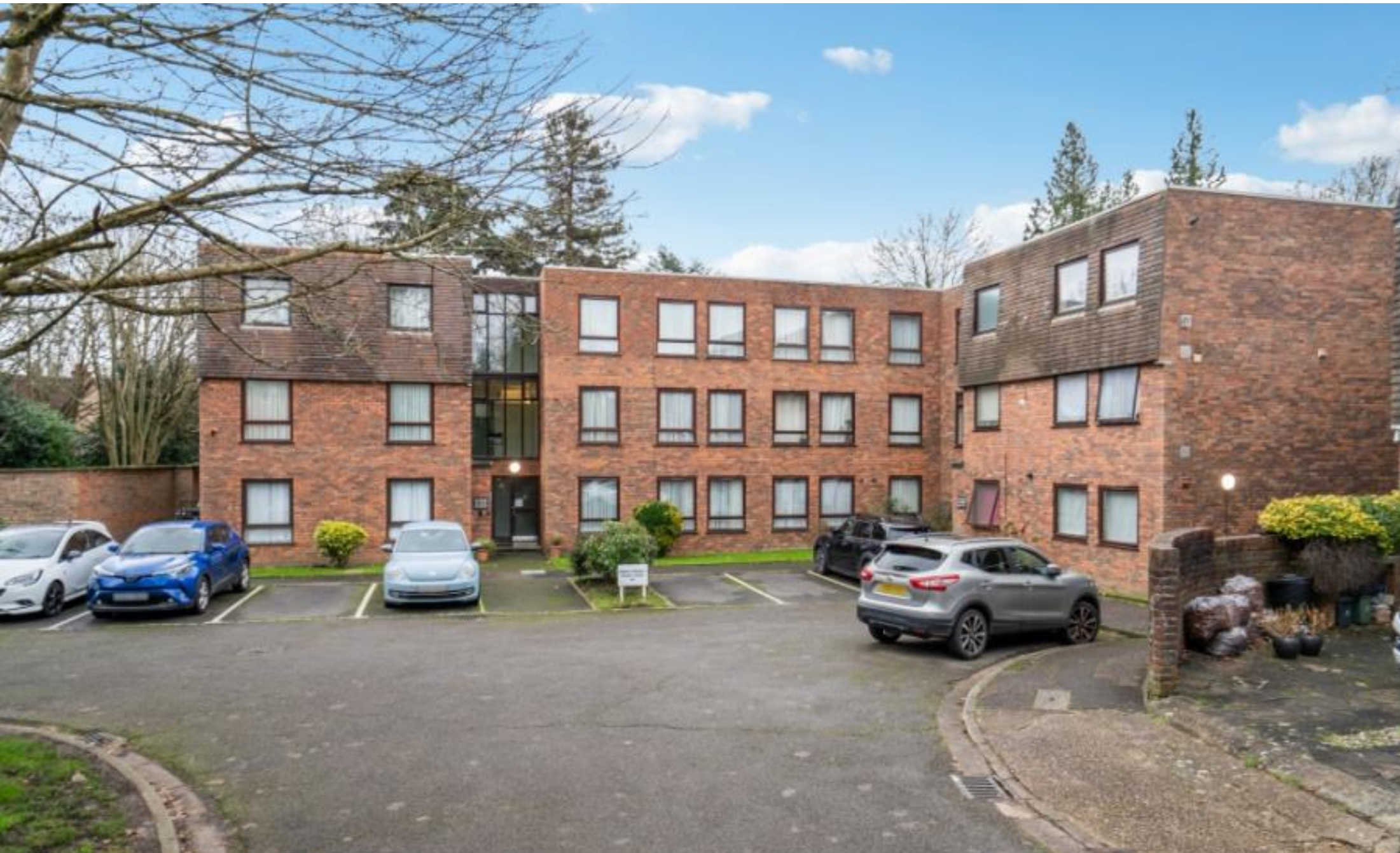
A well presented two bedroom ground floor apartment Woodlea Grove, Northwood, Middlesex HA6 2DW