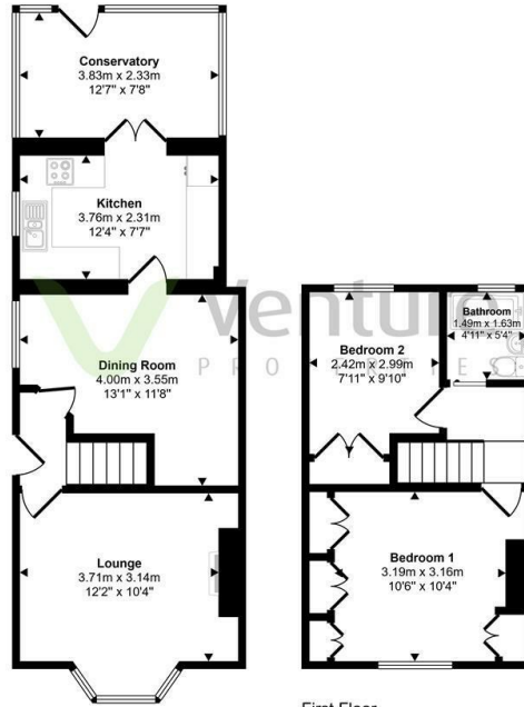
Ground Floor Approx 49 sq m / 529 sq ft

Approx Gross Internal Area 77 sq m / 830 sq ft